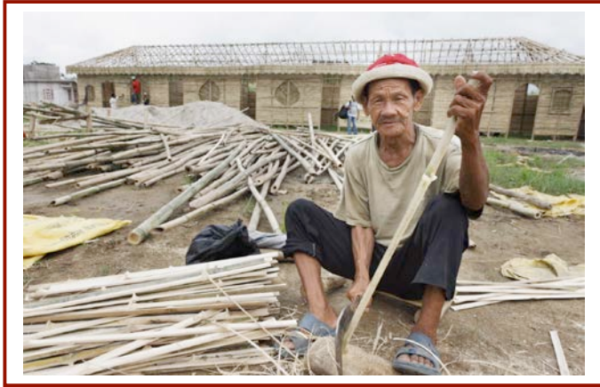
Construction of the school in Kawasowti