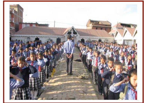
The start of a school day at Baktapur School

A small percentage of children still do not attend school every day. One reason is that occasionally some of the girls are needed to stay home and help their families. The school staff and Uttam spend considerable time talking to these families and explaining how important education is for them and how it will benefit their communities.