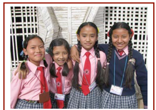
Girls enrolled in the bamboo school in Patan