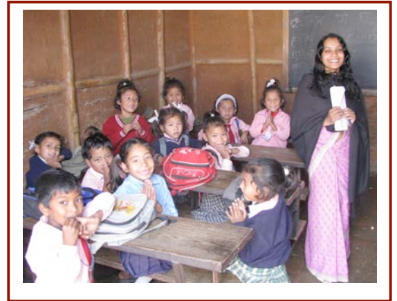
A group of students and their teacher at the Patan School