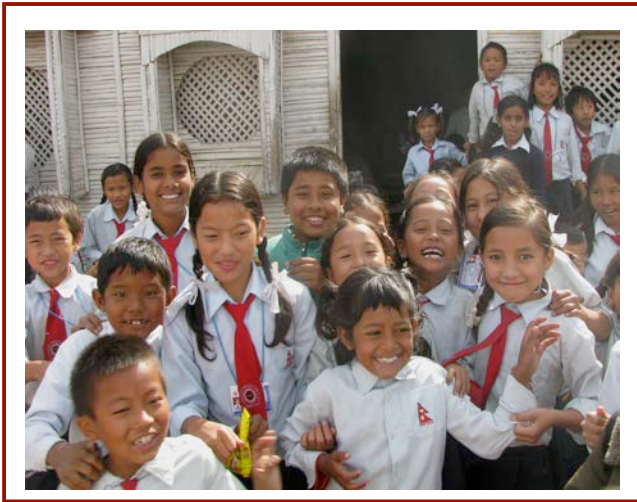
A group of children from the Jorpati School, in Kathmandu, the first school built by Samata Shiksha Niketan.