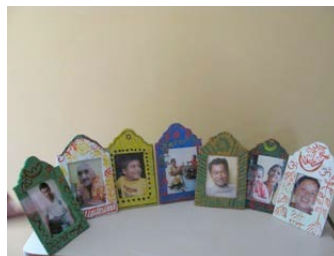
frame in Papier-mâché