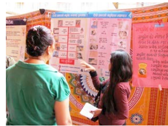
The rainy day did not prevent the people to come check their blood sugar and received health Education on diabetes.