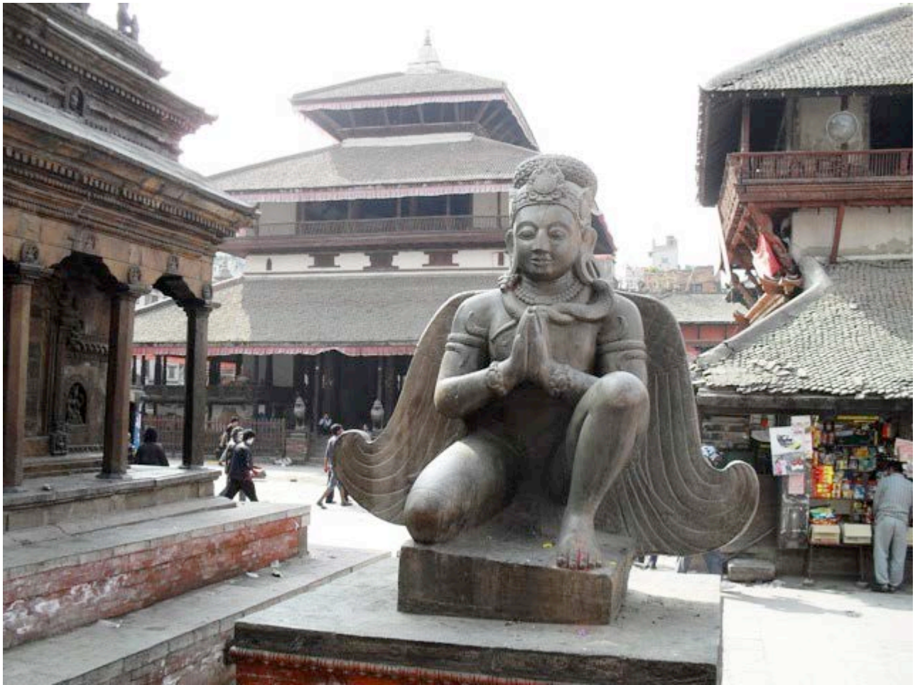
Kathmandu, Durbar Square.