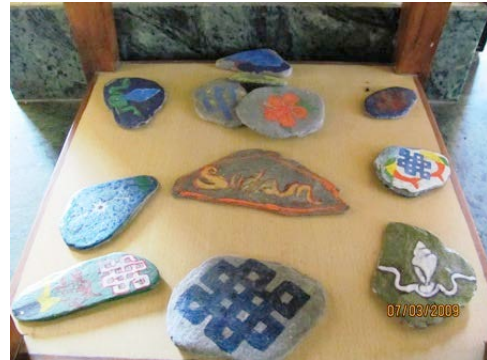
Produced by the patients at our Palliative care Unit