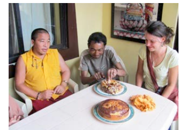
patients enjoying the cake!