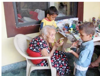
Painting the pottery

A volunteer nurse proposed to animate workshops and encourage the natural skill sets of our patients. She organized those activities during her of 3 month stay in Nepal. One of our patients, who is 101 years old, suggested, at the beginning of the workshop, to make clay butter lamps to worship the gods. This first activity was followed by many others such as Glass Painting, Paper Flower, and Origami, Frame in Papier-Mâché, Jar's painting..... and making cakes!